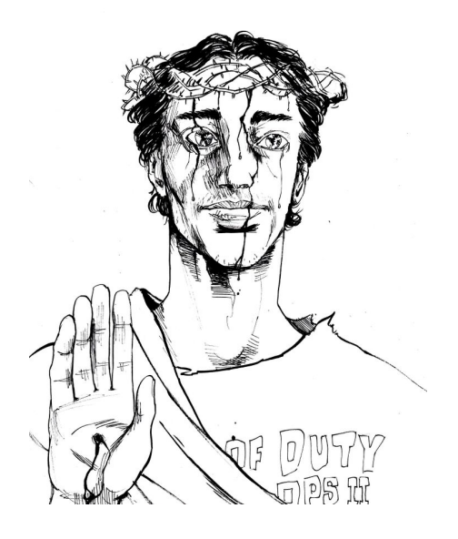
Visual representation of St. Blackops2cel according to Bibipi (2019), editor and writer on incels.wiki

There were also three additionally randomly chosen articles for further analysis of the presence of postfeminist narratives tracking the presence of hegemonic masculinity, natural essentialism and their implications on the identity of members of Incel. Namely the Tyrone , Mutations and Gigachad , where the aim was to detect the postfeminist narratives. According to the Incels.wiki,